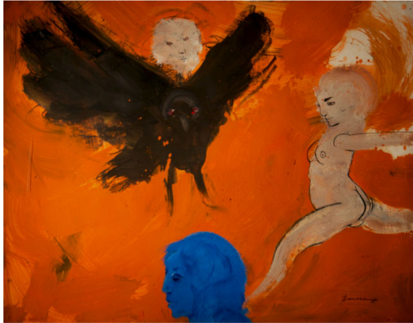
Robert Beauchamp UNTITLED, Circa 1960 Oil on paper, 18 ¾ x 23 ¾ inches

Past installation of the work of Robert Beauchamp from the 1960s: